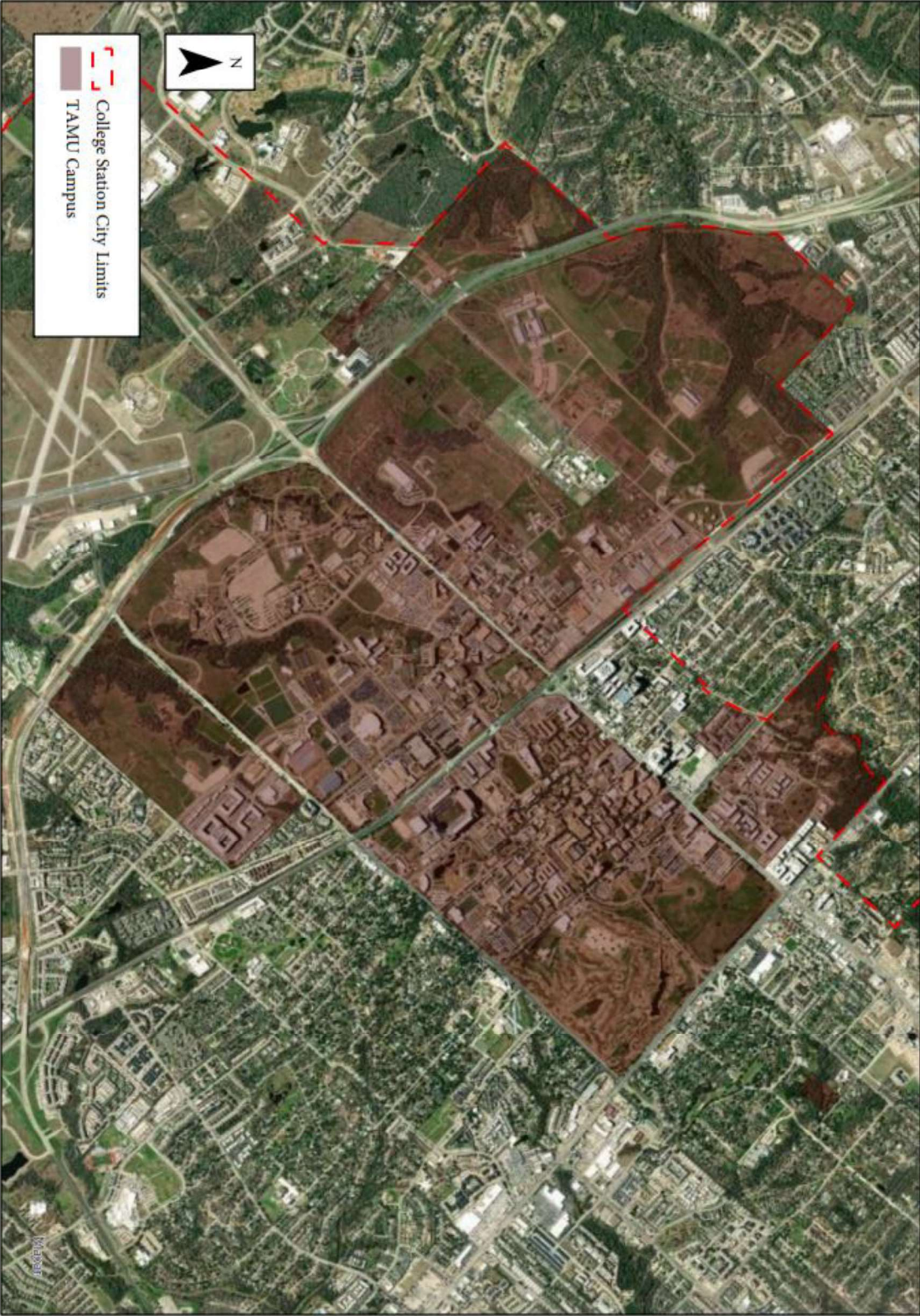
Exhibit "A" Emergency Fire Protection Map

Campus of Texas A&M University and College Station City Limits