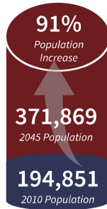
Brazos County Population BCSMPO – Destinations 2045

Existing travel options for residents in Brazos County and the cities of Bryan and College Station are limited causing major congestion and delays for drivers. With the current and expected development in Bryan coupled with the planned growth for Texas A&M in College Station, the need for additional travel options is a top priority to ensure residents and visitors can continue to access their homes, places of work, and favorite destinations with ease.