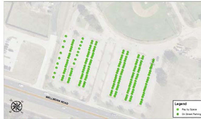
Wayne Smith Surface Lot (192 Spaces)