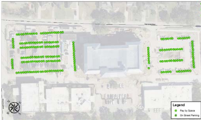
City Hall Surface Lot (207 Spaces)