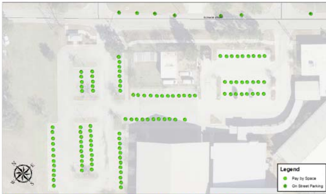
Lincoln Center Surface Lot (110 Spaces)