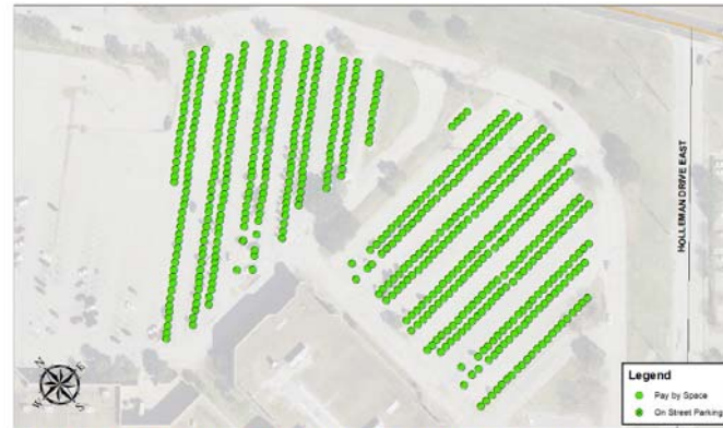
Post Oak Mall Surface Lot (662 Spaces)