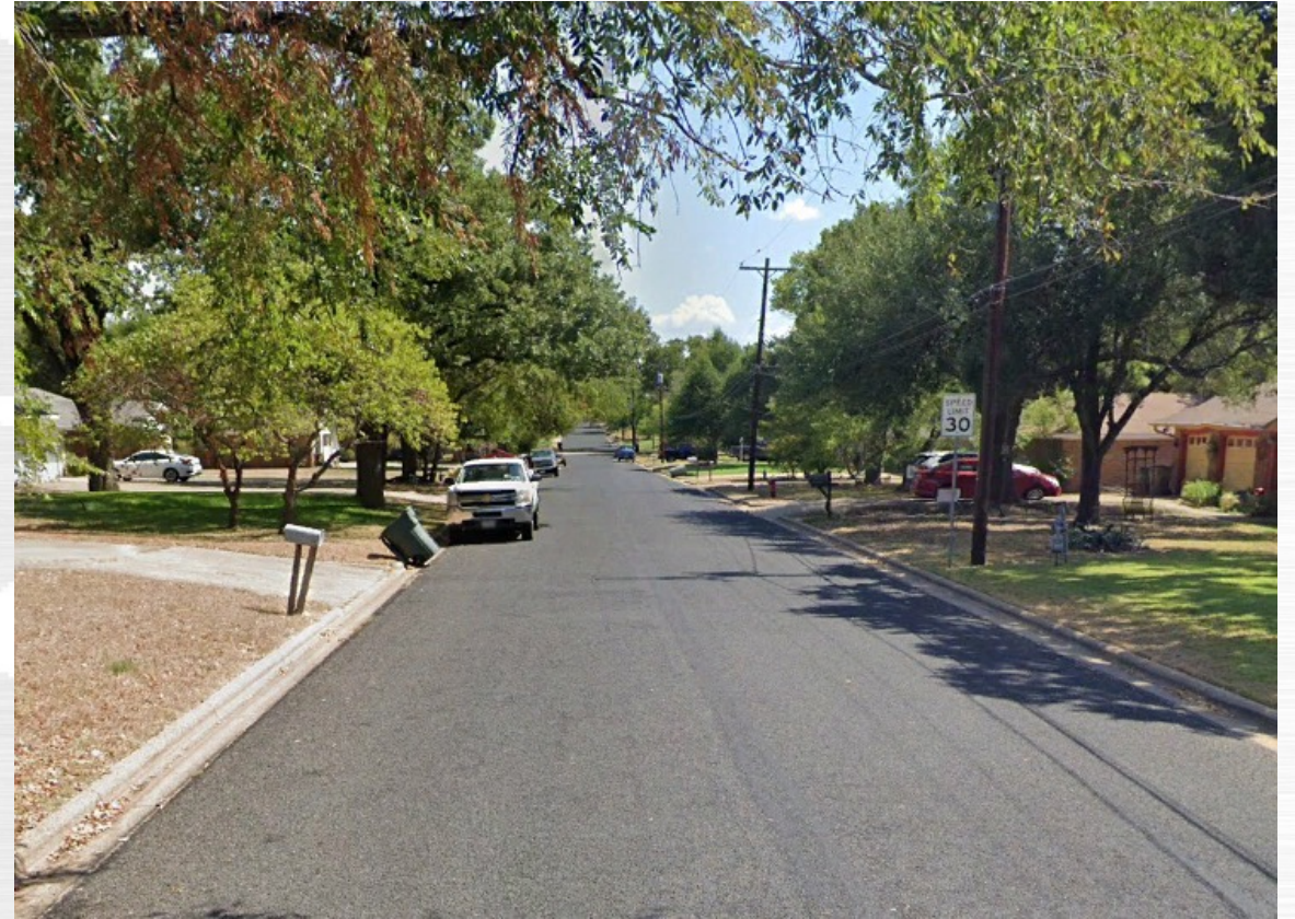
Tee Drive from Wellborn Road to Green Street