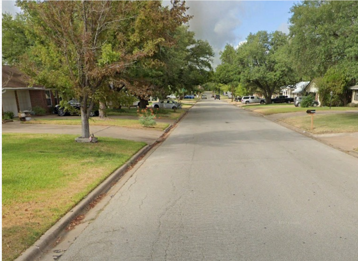
Esther Boulevard from East 29 th Street to Twin Boulevard