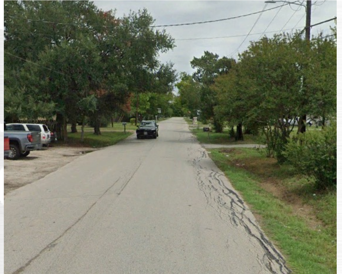
Bittle Lane from Leonard Road to Finfeather Road