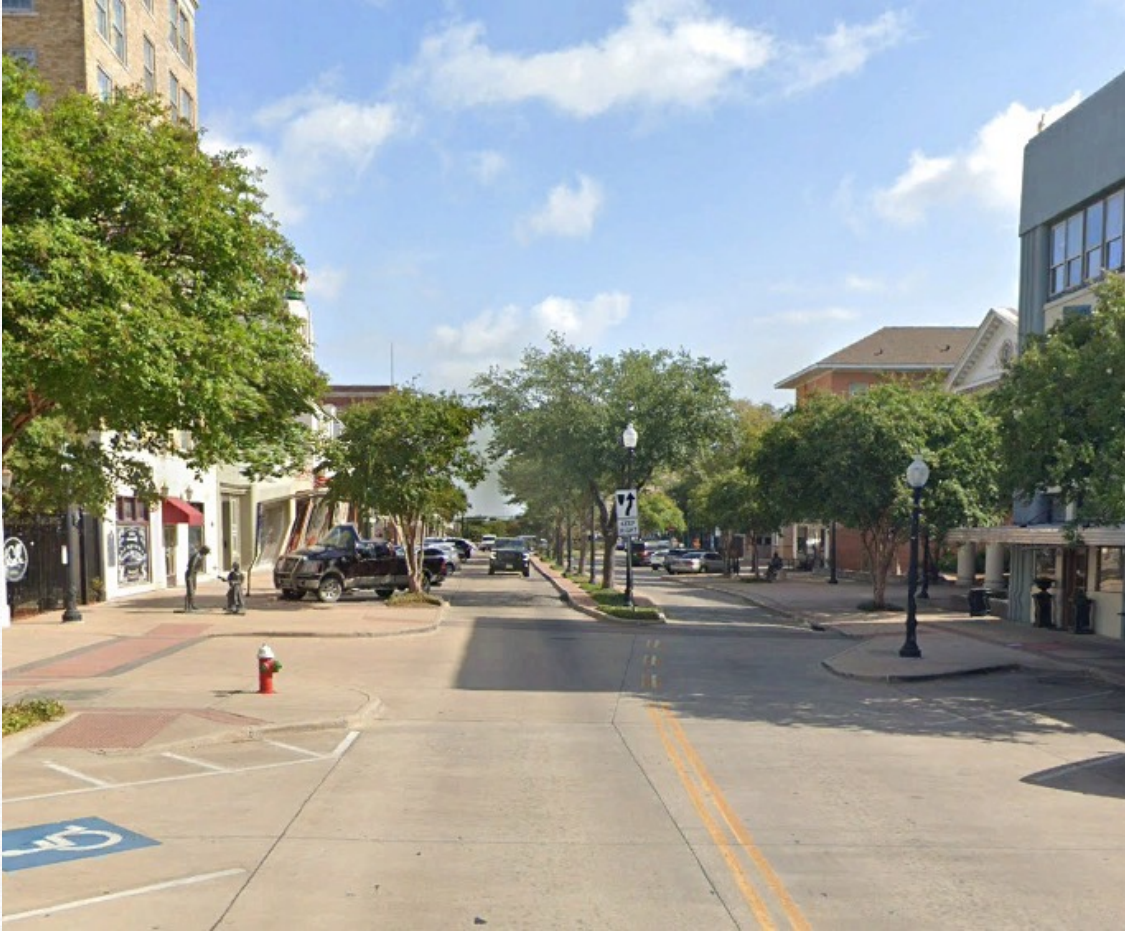
Main Street from 28 th Street to MLK Jr Street