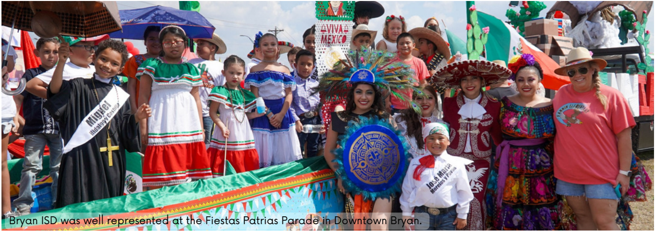
Bryan ISD was well represented at the Fiestas Patrias Parade in Downtown Bryan.