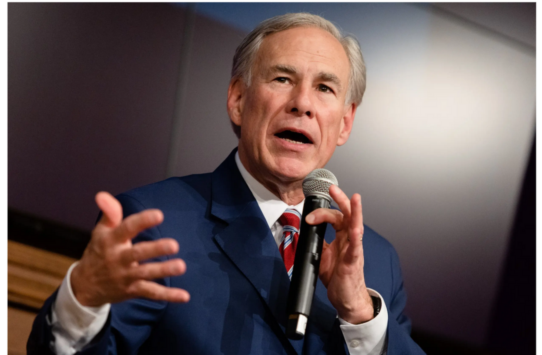
Gov. Greg Abbott speaks about the recent 88th Legislative Session to an audience at the Texas Public Policy Foundation offices in Austin, on June 2, 2023.