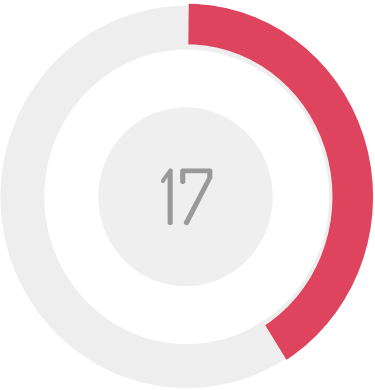
Currently Enrolled in Accelerated Academy

[CVHS-AA expected to graduate in May/August 2023]