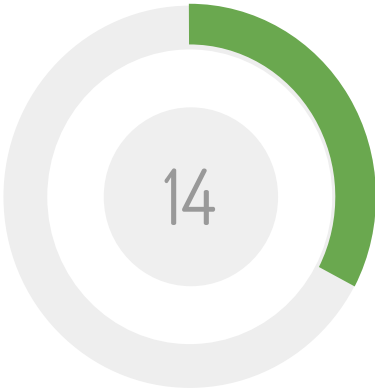
Withdrew to Other Program (e.g., other schools, home school, dropouts)