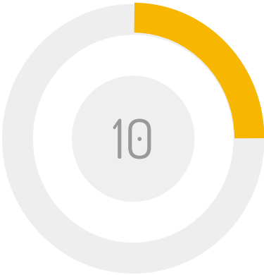
Completed Graduation Requirements & Exited Program

[CVHS-AA expected to graduate in May/August 2023]