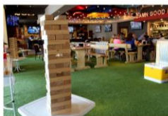
OUTDOOR FAMILY GAME