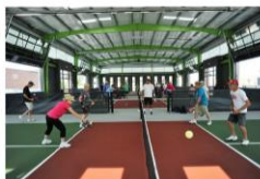
PICKLE BALL COURTS