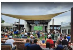
OUTDOOR STAGE WITH SCREEN