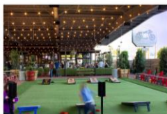
OUTDOOR CORNHOLE FIELD