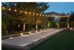
BOCCIE BALL COURTS