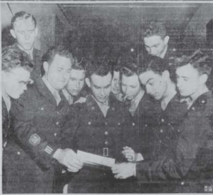
CADET OFFICERS STUDY LISTS—Senior Cadet Officers at Texas A&M college, ordered to go before a Military Investigation Board at the school, study a list from the court to determine when they will be called. Military panels at the school were considering some 140 senior cadets on charges of hazing and discipline in order.

While all figures have not been tabulated, covering the types and number of vehicles for which licenses were sold, the total in money for March was $92,654.01, compared to $86,229.24 for March and April in 1946, or an increase in the one month of $12,424.75. The county retains all of the first $25,000 and half of the re-