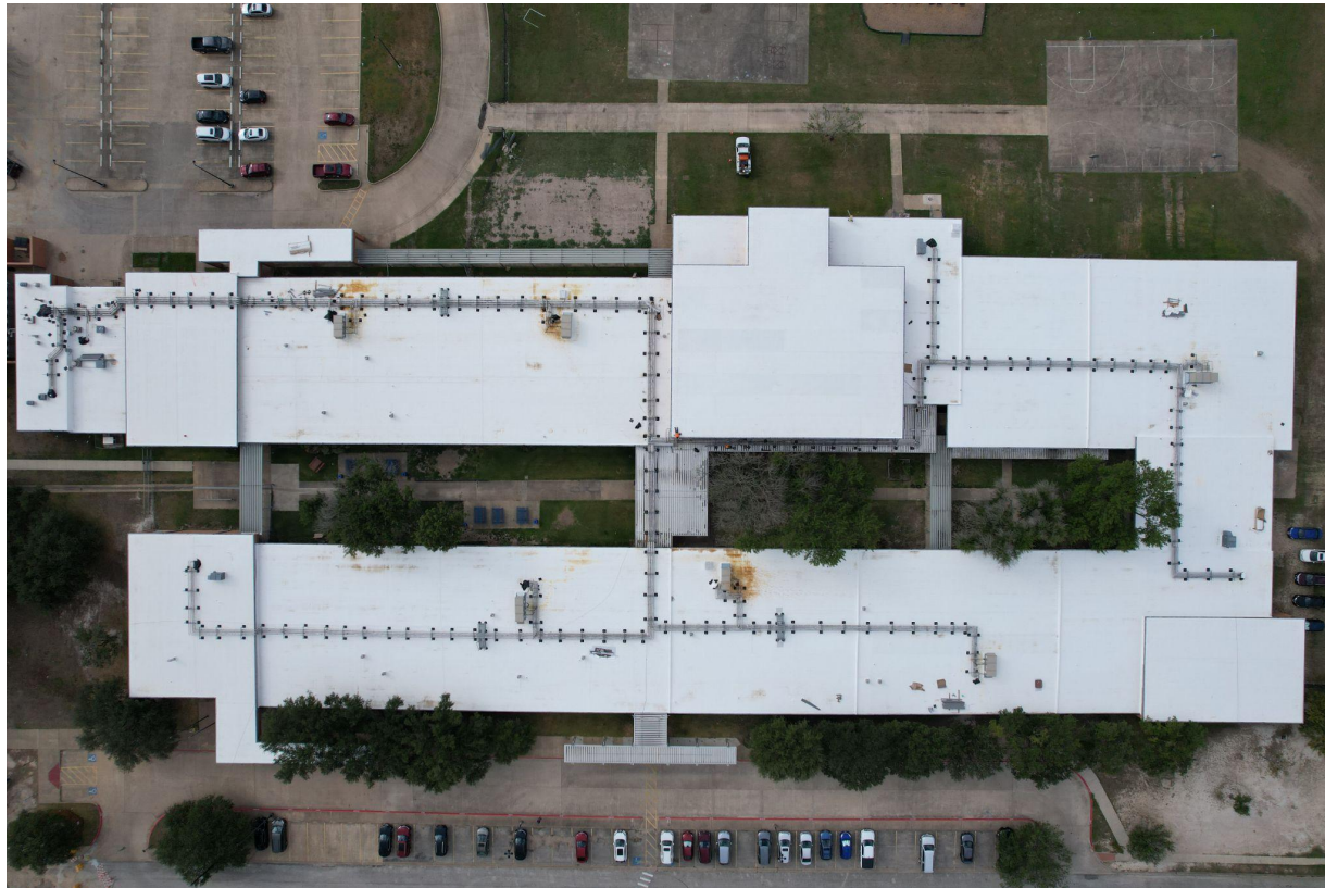
Jones Elementary School Roof