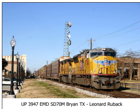
UP 3947 EMD SD70M Bryan TX