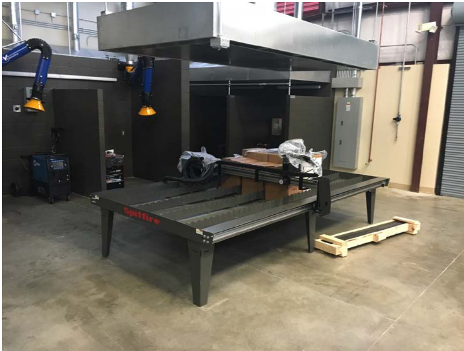
CNC Plasma Table