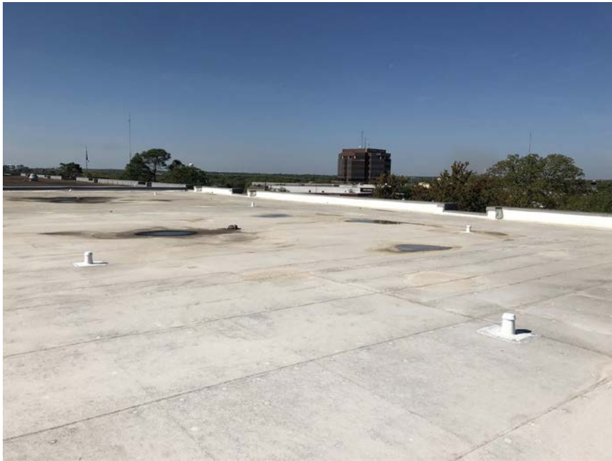
Roof over Gym # 2