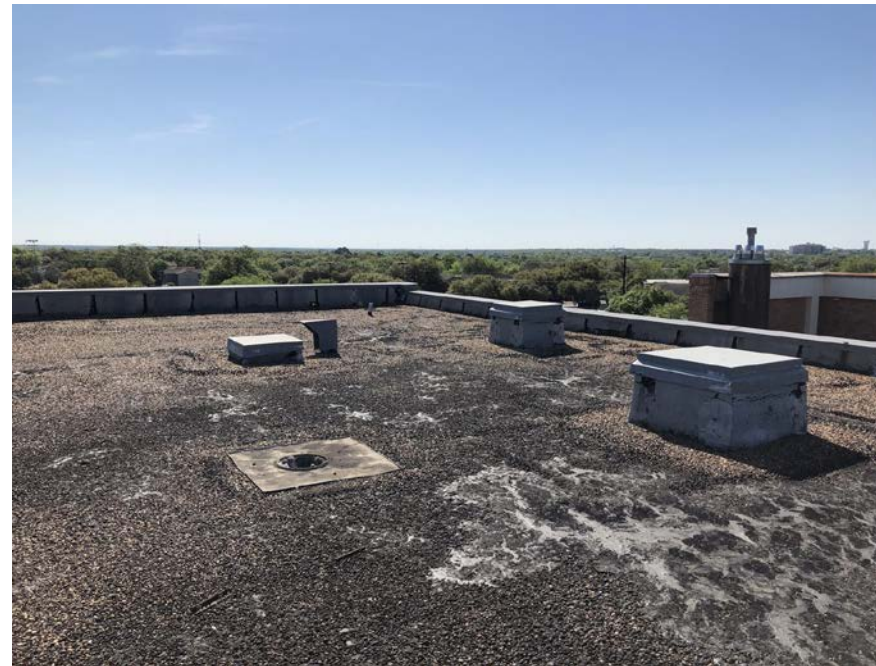
Roof over 520 0 wing