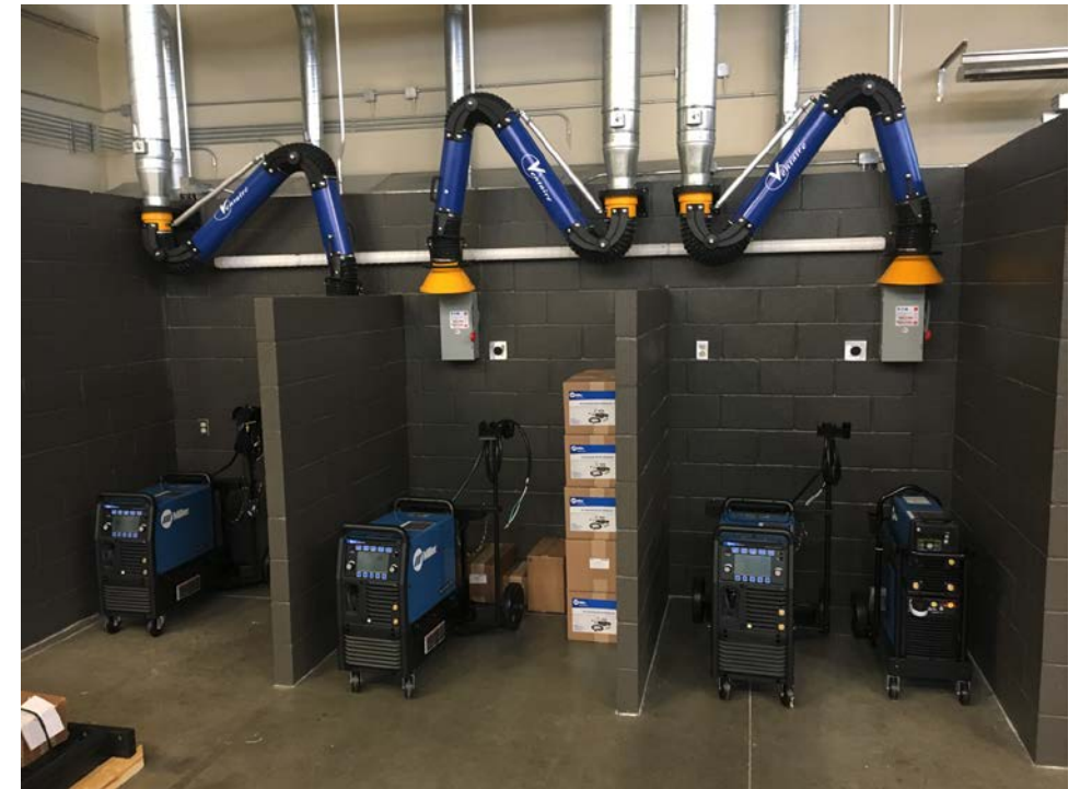
Welders, Snorkels, Welding Booths