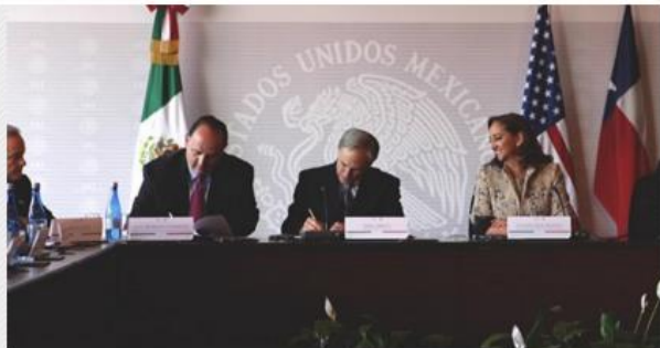
Governor Abbott signs transportation agreement with Mexico