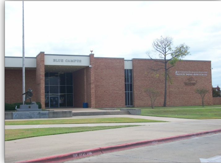
EXISTING BUILDING ENTRIES