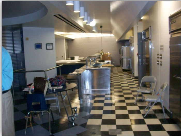
EXISTING CULINARY KITCHEN