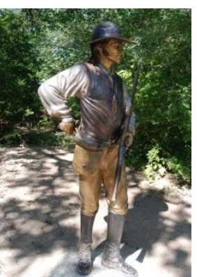
Come and Take It War for Texas Independence