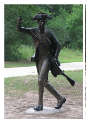
Liberty or Death American Revolution

The willingness with which our young people are likely to serve in any war, no matter how justified, shall be directly proportional to how they perceive veterans of early wars were treated and appreciated by our nation. — George Washington