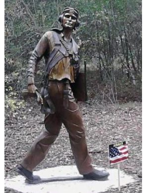
Day of Infamy World War II